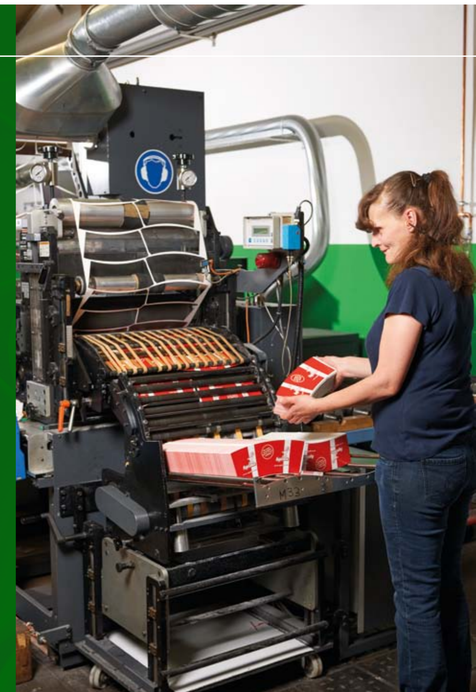
Visual inspection at the flexo printing press